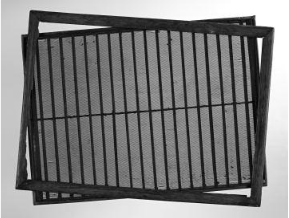
Figure 2. A mould and deckle (date unknown). The face of the mould measures 39.5 x 54.5 cm overall; the deckle measures 41 x 56 cm overall. The inside edge of the deckle measures approximately 21½ x 15½ inches: the size of sheet made by this mould.

standardization: once you have a mould, you cannot change its size; you can only make or acquire other moulds of a different size. This description needs to be made more precise: in the last analysis it is not the mould that defines the size, but rather the 'deckle' that gives the precise size. The 'deckle', as the German and Dutch senses of the word suggest, is a frame, or a rectangular fence, placed over the mould.