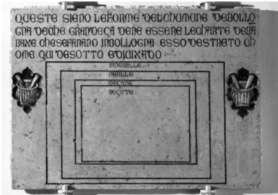
Figure 3. The Bologna stone, showing the four standard paper sizes, circa 1389. Overall dimensions of the stone: 75 x 103 x 3.5 cm. The sizes of the rectangles that indicate paper-sheets, as given by the Museo Civico Medievale, Bologna: 50.5 x 73.5 cm; 44.5 x 61 cm; 34.5 x 50 cm; 31.5 x 44.5 cm. (Museo Civico Medievale, Bologna.)

between 1 Bolognese soldo and 5 Bolognese lire. The statutes do not spell out the sizes of these standard sheets, rather they give weight: thus each 'ream' (about 500 sheets) of the imperial size should weigh 57 Bolognese pounds. Prices were also fixed: a ream of the imperial size would cost 7 Bolognese lire.